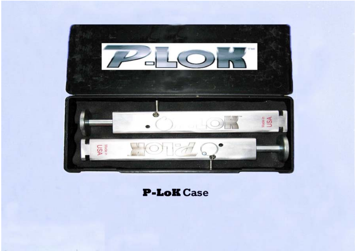
Figure 15: P-LOK™ Case