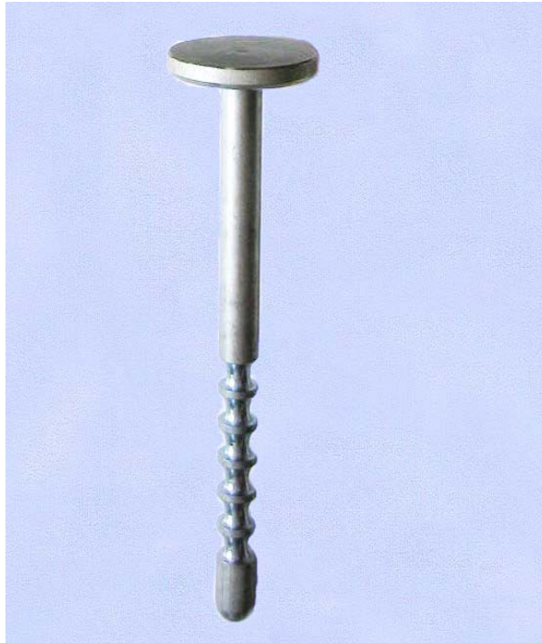
Figure 14: P-LOK™ Rod